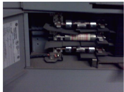
Visible Light Image